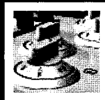
46" GAS DROP-IN COOKTOP E46GC67ESS